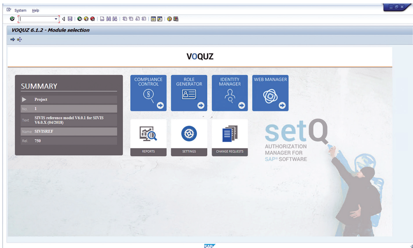
Figure 1: setQ user interface – your cockpit for easy authorization management

Even during the plug-and-play creation of new roles and concepts, setQ runs real-time checks for critical SOD conflicts in the background and can prevent them from being pushed to production automatically. The deployment of your new roles follows a transparent ruleset and does not require complicated tinkering to get started. While legacy Identity Management for SAP requires complex knowledge and months of setup and refinement, a setQ install is fast and simple.